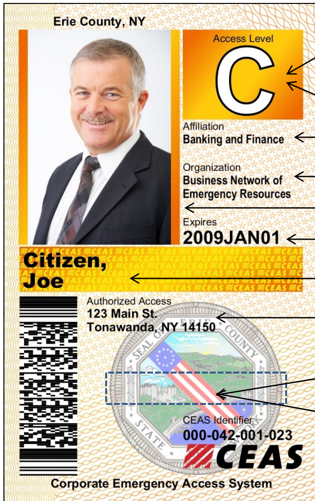
CEAS Standard Card

Access Level – ensure card corresponds to announced level of activation